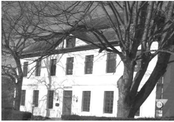
Head Quarters Essen - Germany