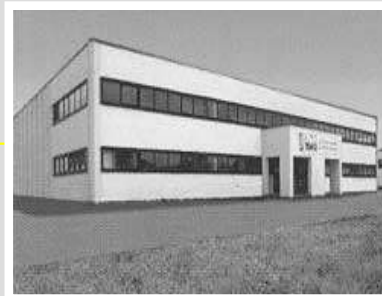
Transformer Plant Turin - Italy