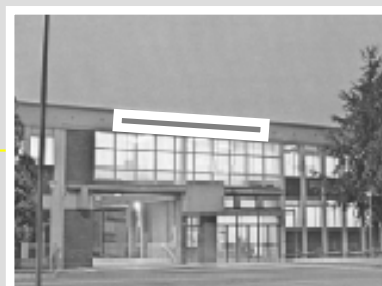
Power Busbar Plant Torino - Italy